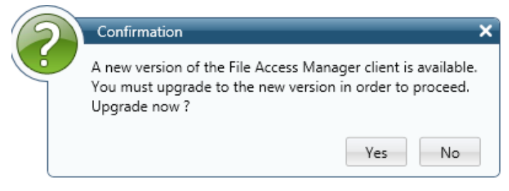
Figure 4: Message - Update File Access Manager Client

On the first run of the IdentityIQ File Access Manager administrative client after an update, a popup message displays, requesting that you update the client. During the update, you will be required to reenter the server on which the User Interface Service is installed.