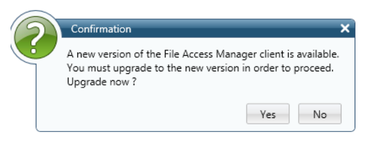
Figure 4: Message - Update File Access Manager Client

On the first run of the IdentityIQ File Access Manager administrative client after an update, a popup message displays, requesting that you update the client. During the update, you will be required to reenter the server on which the User Interface Service is installed.